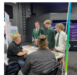
VCE VM Students attending the Emerging Industries Careers Expo this week hosted at the Riviera Christian Centre